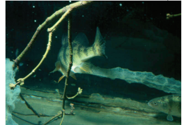
Spawning female yellow perch ( Perca flavescens ) and accompanying male.